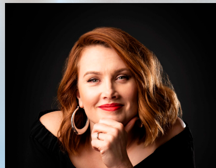
Guest speaker was Clare Bowditch, musician, broadcaster, actor, entrepreneur and best-selling author