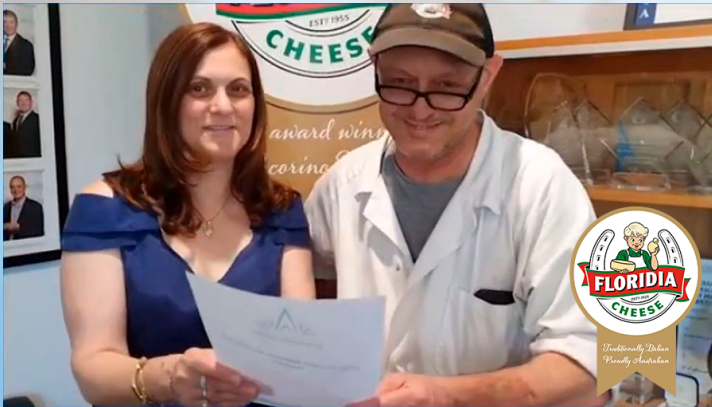
Victorian Government Business of the Year 2020 – Florida Cheese

Victorian Government Business of the Year Award – Florida Cheese Bank of Melbourne Best Start-Up or Microbusiness Award – Blue Pear Pantry MatchWorks Customer Service Award – Sealane Group Matthews Steer Export Award – Florida Cheese Macpherson Kelley Human Resources Award – Sage Business Group Snap Industry Education Engagement Award – Dulux Australia AusIndustry Innovation and Enterprise Award – Posture Balance Options Consulting Group Outstanding Initiative in Manufacturing Award – Glenroy Bakery Inner North Community Foundation Philanthropy and Community Service Award – Moon Rabbit Jemena Sustainability and Environment Award – Ben Hutchinson Landscapes ReadiiTel Technology Innovation Award – Ultralift Australia Melbourne Polytechnic Workplace Diversity Award – Mocopan Coffee Chair's Award – Repurpose It